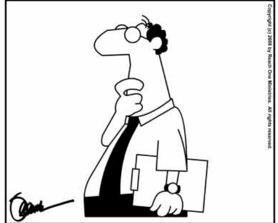
I wonder if I could've made a mistake. Naw, there must be some other explanation! Website: macvalleybaptist.com